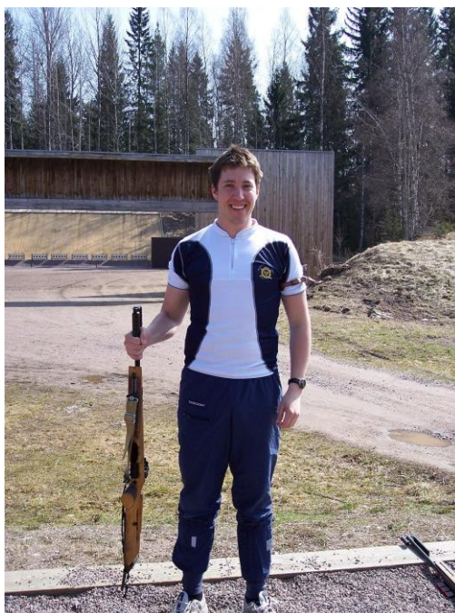
The only way of carrying the weapon at the shooting range